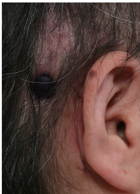
Fig. 1. Thick, blue eschar formation is seen in the postauricular region. The location is consistent with the site of bone marking done using methylene blue.

tive period. However, 8 weeks after surgery, the woman presented with a bluish discoloration over the implant site, which was consistent with bone marking using methylene blue. She was otherwise well with no local erythema, fever, or swelling. The lesion developed a progressive thick, blue eschar formation and skin flap necrosis (Fig. 1). The flap necrosis did not respond to conservative treatment. There was